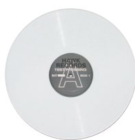
WHT-868 A L-31046