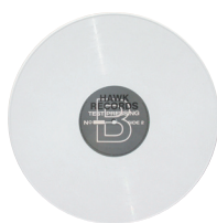
WHT-868 B L-31046-X